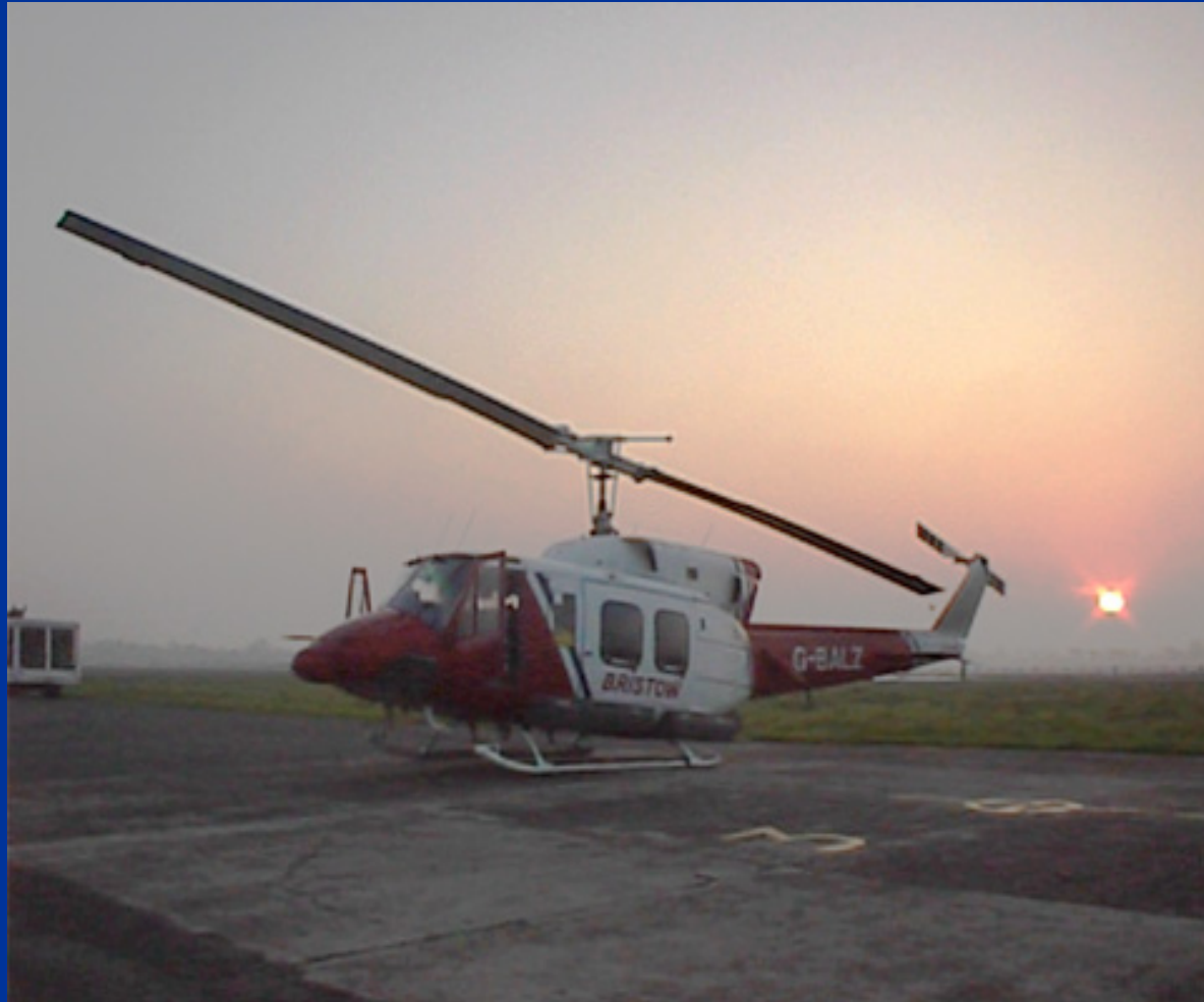
Bristow Bell 212EP G-BALZ – Operating today in Mauritania